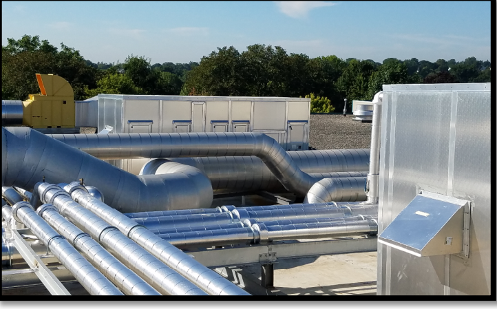
For More Information: www.easinc.net